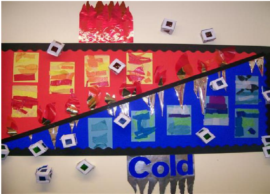
Collages created from pieces of scrap paper – tissue, magazines, cellophane etc – to build up a colour palette.