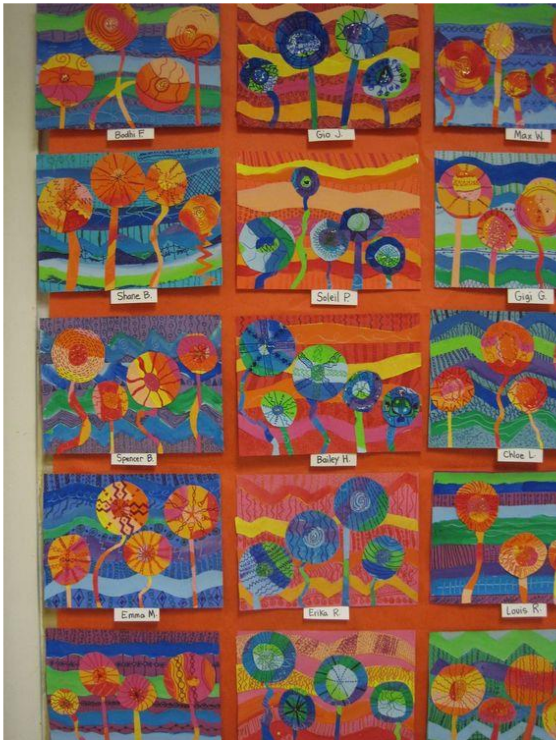
Layers of different shades of colour – tissue, paint, pens etc, overlaid with flowers of another set of colours.