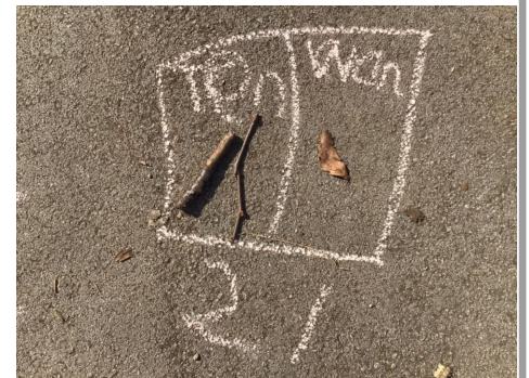
Place Value outdoors in Sparrowhawk Class.

Play equipment —The children have loved returning to school to play on the new play equipment that has been installed around the Daily Mile track. There is something for everyone, adding a new physical challenge into playtimes.