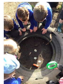
Searching for clues and making posters with Kestrel Class.