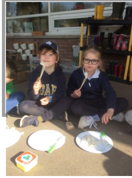
Chopstick challenges in Owl Class.