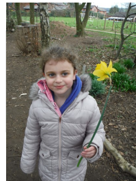
Day of reflection daffodils