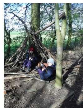
Forest School reflection journey sticks.