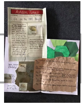
Beautiful presentation in Buzzard Class